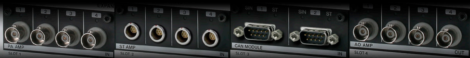
AO Amplifier Module