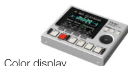
Color display remote control unit