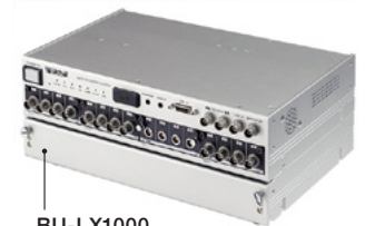
BU-LX1000 Mounting image with 16CH model

* Batteries and battery charger are sold separately. Continuous operation time on battery unit: approx. 7 hours